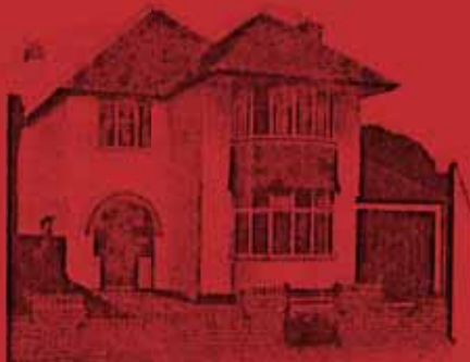
UNUSUALLY CHARMING IN DESIGN

Detached Residence with 3 Bedrooms and Garage