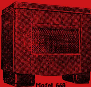
Model 668 Available shortly

the models which set the standard in everything which makes listening enjoyable. Come and hear these "H.M.V." sets yourself—we have a wide range in stock.