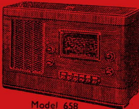
Model 658 5-valve superhet receiver with AVC. 3 wave ranges. Six station push buttons. 13½ Gns or by hire purchase

Yes, there were plenty of sensations at this year's Radiolympia in the way of purer tone, greater selectivity, easier tuning and improved cabinet design. But the talk of the show was undoubtedly the new 1938-9